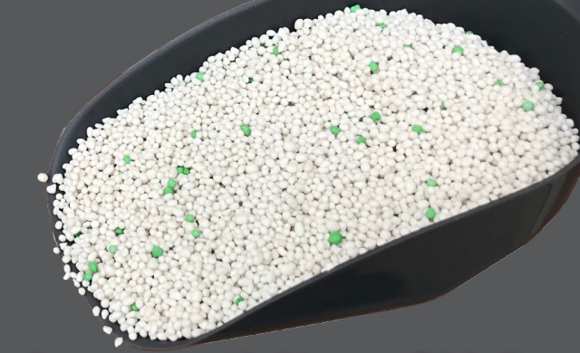
Learn more at bektra.com/binballs