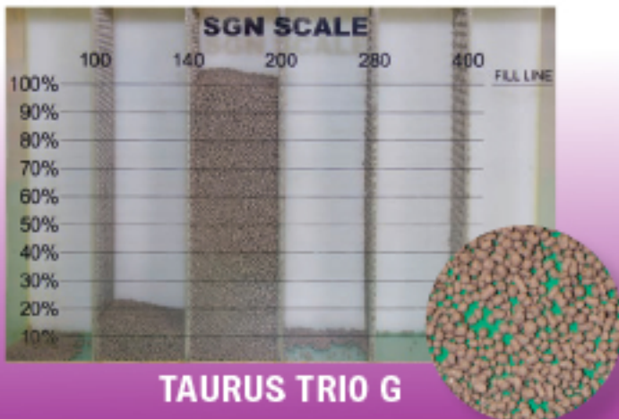
TAURUS TRIO G

quali-pro.com Facebook: @qualipro Instagram: @quali_pro